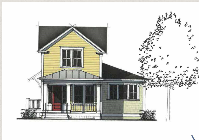
Unit Style C